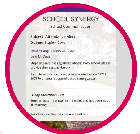
Click through to the message