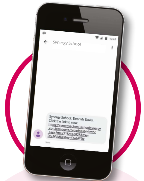
A text is received from school

Take a 2 minute tour of the Parent Portal https://vimeo.com/506028955/89e980e50f or scan this QR code with your phone